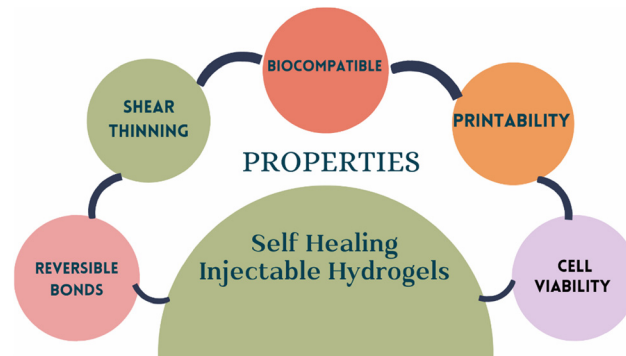
Fig. 1 A mind map representing different properties of self-healing injectable hydrogels, which aid in the potential to be the best alternative for traditional biomaterials. The reversible bonds and shear-thinning nature are the essential properties determining self-healing injectable hydrogels' nature.

The definition of self-healing has been evolving with technological advancement since the 1990s. Zeroth generation self-healing materials are defined as those that retard, but do not repair mechanical damage. First-generation self-healing materials are defined as those that irreversibly repair but do not restore the damaged matrix, while second-generation materials are based on reversible shape restoration. 15 They can go through numerous cycles of stretching and breaking, but they ultimately mend by themselves. As a result of the hydrogel's inevitable breakdown, 16 cell would diffuse into the surrounding