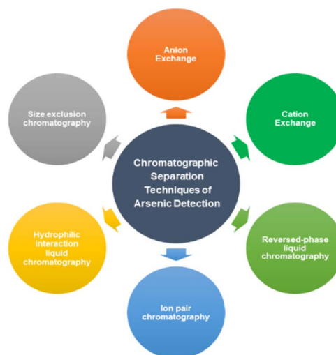
Fig. 5 Different chromatographic techniques for arsenic detection.