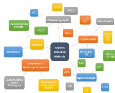
Fig. 3 Different methods of arsenic detection and determination.

The purpose of this review is to provide an overview of the analytical techniques (chromatographic, spectroscopic, colorimetric, biological, electroanalytical and coupled techniques) for arsenic determination in drinking water and the authors have mostly covered the literature over the past decade (2010 onwards). Some older publications are referenced to support the key concepts and wherever necessary. A brief introduction to various analytical techniques followed by an evaluation of their capabilities and performance for arsenic determination are discussed. Associated challenges as well as potential avenues for future research, including the demand for rapid analysis and on-site technologies for remote water analysis and environmental applications are discussed. We hope that this review