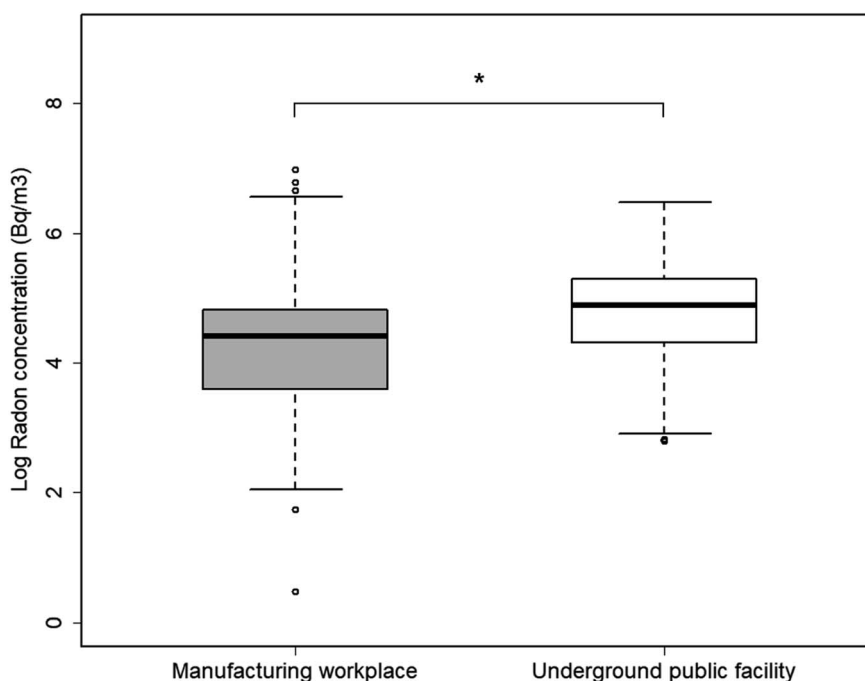
Fig. 2 Box plot of log-transformed radon concentrations measured at the manufacturing workplaces and underground public-use facilities, and the mean radon levels are significantly different ( p < 0.001 ).

The highest level measured for short-term monitoring with the E-PERM® detector for the moulding process of A7 was