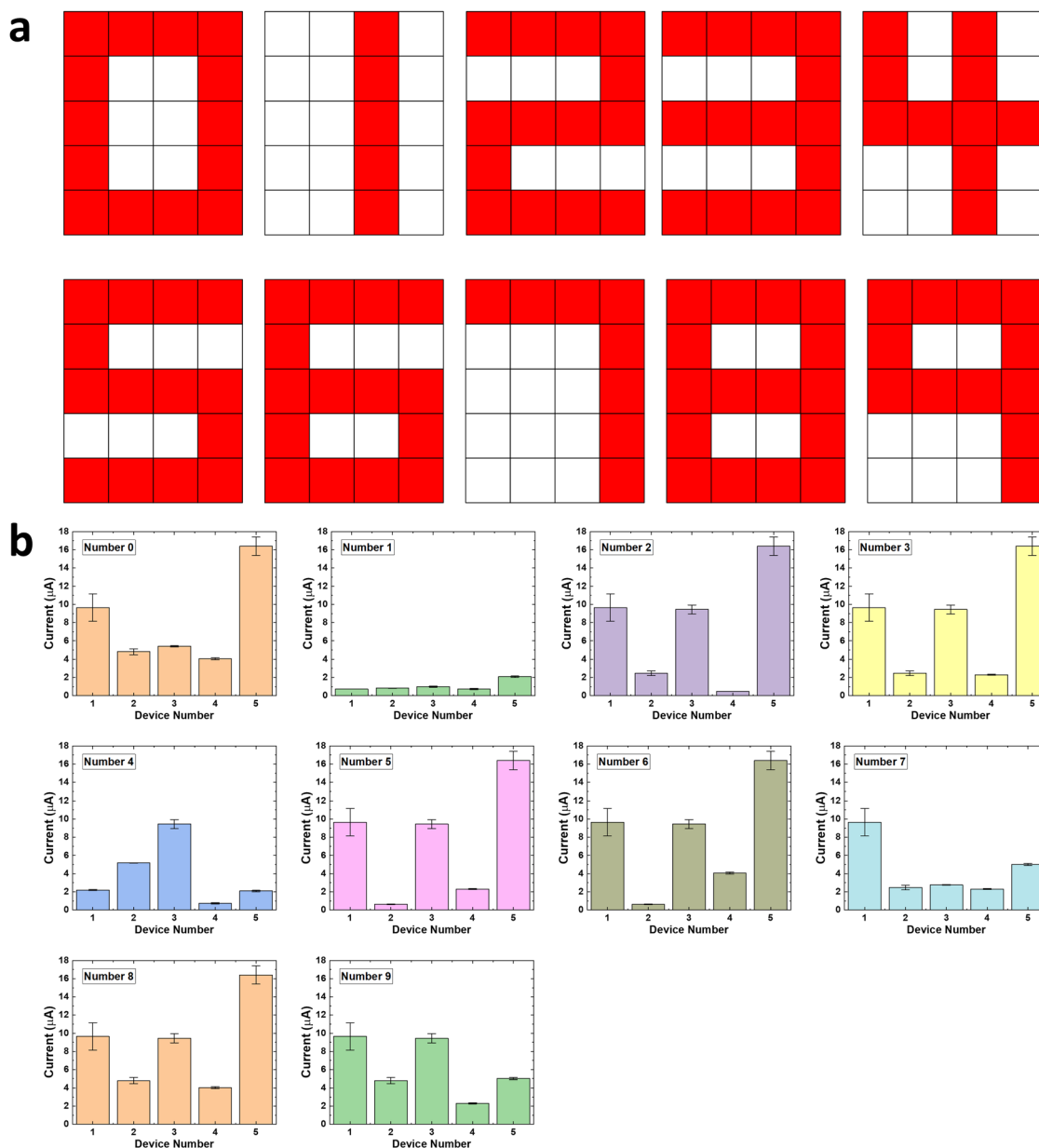
Fig. 5 (a) Images of 10 numbers used in this test. (b) Measured reservoir states after the memristors are subjected to the 10 inputs. The reservoir states are reflected as the read currents of the 5 memristors forming the reservoir.