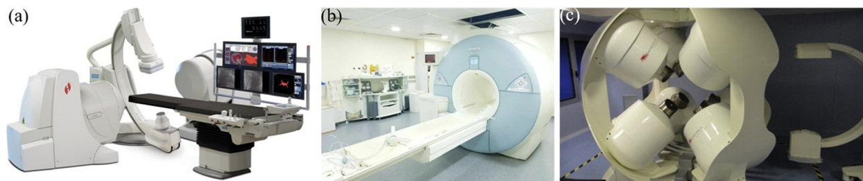
Fig. 12 Commercial magnetic actuation equipment for healthcare applications. (a) Image of the Niobe system. (b) Image of the MRI system. (c) Image of the CGCI system.

Similarities. From the view of the actuation mechanism, both optical microrobots and magnetic microrobots are actuated by physical field sources and convert the external potential energy into kinetic energy. Optical field-driven microrobots can acquire power from the light pressure of the laser or the optical gradient force induced by the laser to achieve locomotion. They can be actuated by a single beam, multiple beams or even light patterns, which are accessible from different light sources, including lasers, LEDs, and DMDs. 22,23,27,28,62,73,75,77 Magnetic field-driven microrobots can receive torque or force generated by changes in the external magnetic field for navigation or transportation. They can be actuated by permanent magnets, 163–165 electromagnetic coils, 166–168 or other different configurations of magnetic devices. 169–172 Moreover, both optical microrobots and magnetic microrobots need imaging equipment ( e.g. , microscope, high-resolution camera), computers, and a user interface to