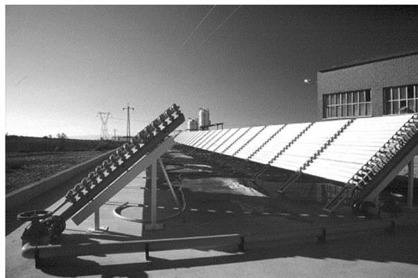
Fig. 22 One of the first pilot plants for photocatalysis, employing a slurry reactor (in a static concentrator array) installed at latitude 40° (Arganda del Rey, Madrid, Spain). Costing estimates in Section 1 for plant scale PCs are taken from this plant's operation. 62 Reproduced with permission from ref. 67. Copyright 2002 Elsevier B.V.