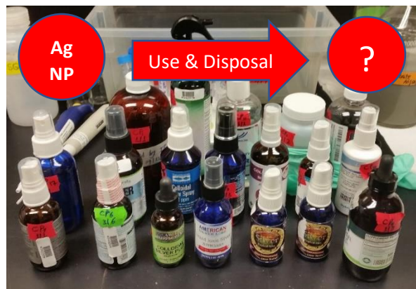
Table of Contents Entry

Sequential exposure of silver nanoparticle suspensions to various media gives new insight to the environmental fate of nano-enabled consumer products.