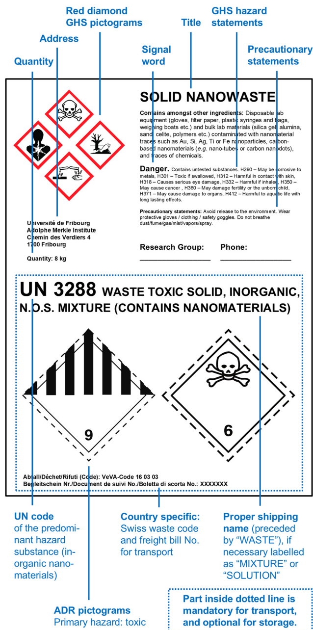
Fig. 5 Example of a single-packaging nanowaste label. Adapted from Schwab et al. 14 with permission from Springer Nature, Nature Nanotechnology , 18(4):317–321, copyright 2023. The label is compliant with the Globally Harmonized System (GHS) 35 and the agreement concerning the International Carriage of Dangerous Goods by Road (ADR). 34 Such combined labels can be used when nanowaste is both stored and transported in the same container. 34,35 Blue text: elements required by different regulations. Blue dotted lines: transport elements required only by ADR (see section labels for storage and transport and SI, case study pilot-scale nanoparticle disposal). For storage-only containers, the transport section is not required. Abbreviations: UN = United Nations. n.o.s. = not otherwise specified. In this example, the country-specific information complies with Swiss regulations. 37,41–43 If the waste contained a larger fraction of organic nanomaterials relative to inorganic nanomaterials, the UN code would change to 2811 (Toxic solid, inorganic, n.o.s.), and the VeVA code would be 16 03 05.

All nanowaste containers must be clearly labeled (Fig. 5). At present, no globally harmonized system (GHS) exists specifically for nanowaste. 14,34,35 Instead, labeling follows the rules for conventional chemical waste under international frameworks (see section “History and regulatory context”). It is essential to distinguish between storage and transport requirements. For storage, labels must follow the GHS 35 and, in the EU, its CLP (Classification, Labelling and Packaging)