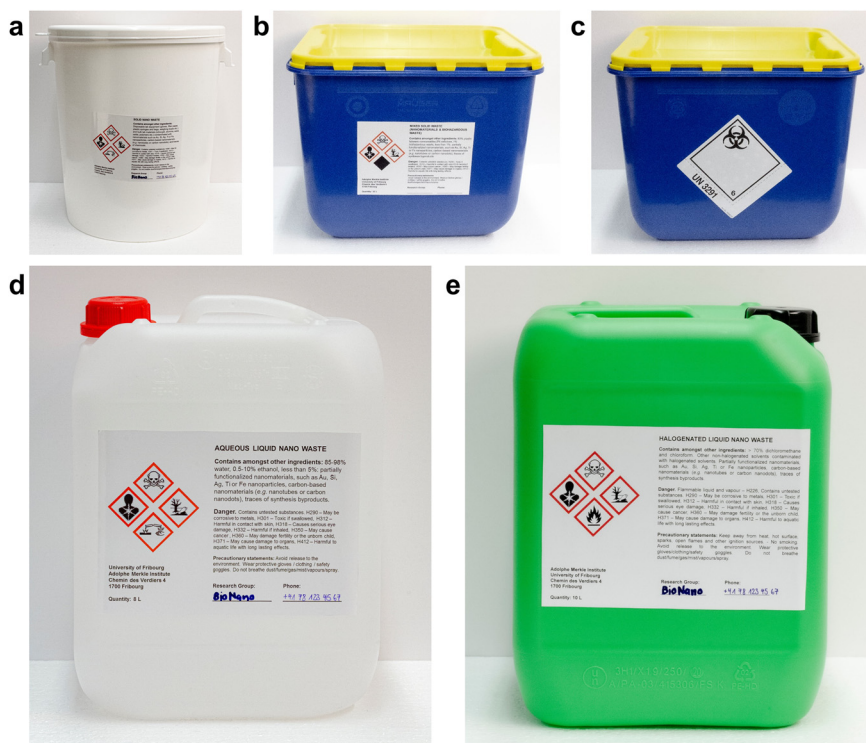
Fig. 3 Representative containers for nanowaste storage and transport. Adapted from Schwab et al. with permission from Springer Nature, Nature Nanotechnology , 18 (4):317–321, copyright 2023. 14 a: White bin for solid nanowaste. b: Blue bin for solid biohazardous nanowaste. c: Example of dual storage/transport container with ADR 34 biohazard pictogram. The United Nations code 3291 stands for not otherwise specified clinical waste. d: White canister for aqueous nanowaste. e: Green container for nanomaterials in halogenated solvents. Contents must always be explicitly listed on the label. 35,36 Waste colors shown are examples and not legally binding. For more details on labeling, refer to the section ‘labels for storage and transport’ and the SI section ‘details on labeling nanowaste’.

generation, fire, explosions, toxic fume release, or spills. The relevant incompatibilities can usually be derived from the bulk material's properties or, for liquid nanowaste, from the solvent used. Substances that must always be stored separately include strong acids, bases, redox-active materials, and solvents prone to forming explosive mixtures. In cases of uncertainty, global 34,35 and local 36,41 legislation may provide detailed guidance on hazardous goods management. Further examples and incompatibility rules are summarized in the SI. To minimize workplace risk, storage of flammable liquids or nanomaterial powders should be kept as low as practicable,