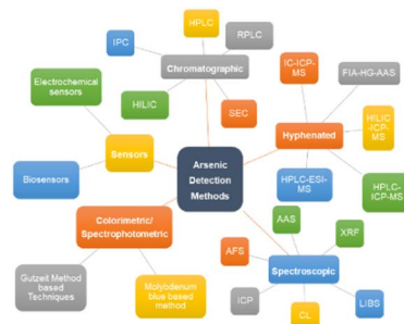
Fig. 3 Different methods of arsenic detection and determination.

The purpose of this review is to provide an overview of the analytical techniques (chromatographic, spectroscopic, colorimetric, biological, electroanalytical and coupled techniques) for arsenic determination in drinking water and the authors have mostly covered the literature over the past decade (2010 onwards). Some older publications are referenced to support the key concepts and wherever necessary. A brief introduction to various analytical techniques followed by an evaluation of their capabilities and performance for arsenic determination are discussed. Associated challenges as well as potential avenues for future research, including the demand for rapid analysis and on-site technologies for remote water analysis and environmental applications are discussed. We hope that this review