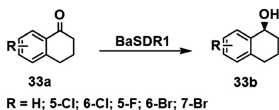
Scheme 16 The BaSDR1 protein catalyzed synthesis of chiral \alpha -tetralinols.

\alpha -Tetralols and their halogenated derivatives are important chiral intermediates in the synthesis of pharmaceuticals such as sertraline. The activity of a KRED, BaSDR1, from Bacillus Aryabhatai towards bulky tetralones was improved using rational design to adjust the steric bulk and hydrophobicity of residues affecting the approach of \alpha tetralone to the catalytic residues in the active site. 110 The resulting variants exhibited enhanced activities and stereoselectivities in the asymmetric reduction of prochiral halogenated tetralones (Scheme 16). For