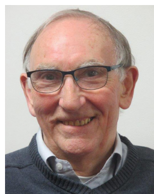
Roger A. Sheldon