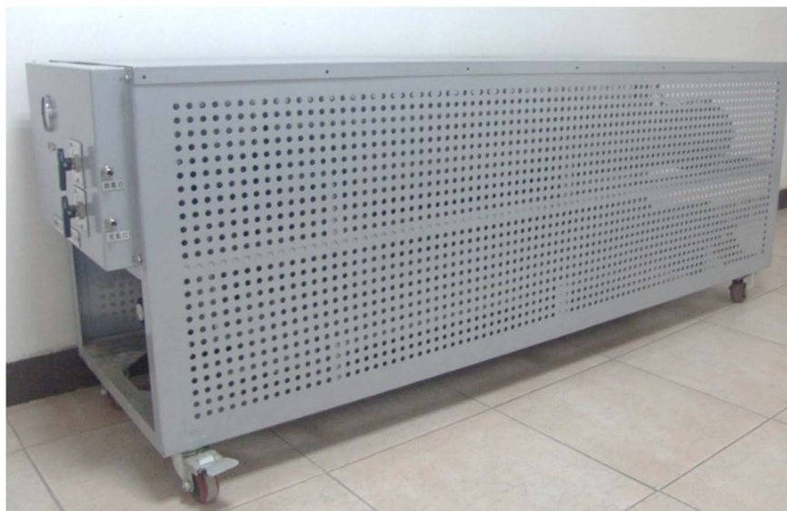
Fig. 4 A hydrogen storage system with modularized structure.