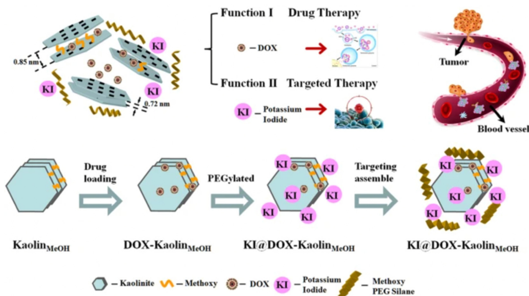
Fig. 9 Schematic representation of the KI@DOX-Kaolin MeOH synthesis and Doxorubicin loading for controlled drug release. 37

Recently, kaolinite nanosheets have been modified to nanotube structures, showing promising results in high loading