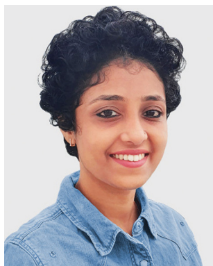
Mrudul Vijay Supekar

Hence with this aim, this review paper is an overview of various works reported on tannin as a potential candidate for developing bio-derived wood adhesives. The article sheds light on multiple related topics, including the methodologies reported for extracting tannin and its classification, followed by a detailed discussion of their pluses and minuses. Increasingly acknowledged renewability, sustainability, lower cost, and chemical