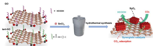
Fig. 1 Synthesis scheme of \text{SnO}_2/\text{GO} and \text{SnO}_2/\text{tert-GO} .

the catalytic conversion of carbon dioxide. Obviously, the chosen supports not only can stabilize the active sites but also provide additional opportunities to enhance the catalytic activity.