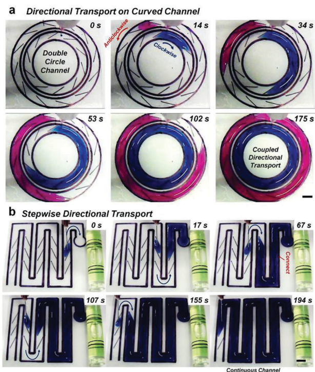
Fig. 5 Directional transport experiments on channels with complex shapes. (a) Unidirectional liquid delivery on a double circular channel. Anticlockwise and clockwise liquid transporting processes can be achieved simultaneously on the same surface by incorporating barrier spines with different directions. (b) Stepwise and programmed unidirectional liquid transport on a polygonal channel. No matter where the droplets are discharged, liquid always spreads against the direction of the spine tilt. Moreover, the asymmetric water barriers allow liquid mixing, connection, and transport from the rear to the front of the channel. Scale bar is 5 mm.

The 2D unidirectional surface with its simplified structure can unlock more possibilities and options for integration into complex fluid controlling systems. Taking advantage of a single-spine channel, unidirectional water transport on curved and polygonal channels can be successfully fabricated, showing the high adaptiveness and universality of our method. A pattern of two circular channels with different directionality can be made on the superhydrophilic surface (Fig. 5a). With continuous liquid injection, water flows anticlockwise in the outer circle; on the contrary, the inner circular channel guarantees clockwise unidirectional spreading (Movie S4, ESI † ). This coupled directional liquid transport demonstrates a valuable and handy method for regulating the moving train of surface fluids. In addition,