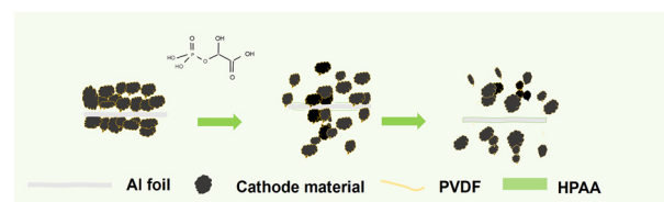
Fig. 1 Schematic illustration of the direct delamination of spent LiFePO 4 cathodes from the Al foil with the assistance of HPAA.

HPAA, an excellent corrosion inhibitor, is chosen because of its strong chelating ability even in an acid or alkali. We first evaluated the effect of the concentration and pH of the HPAA