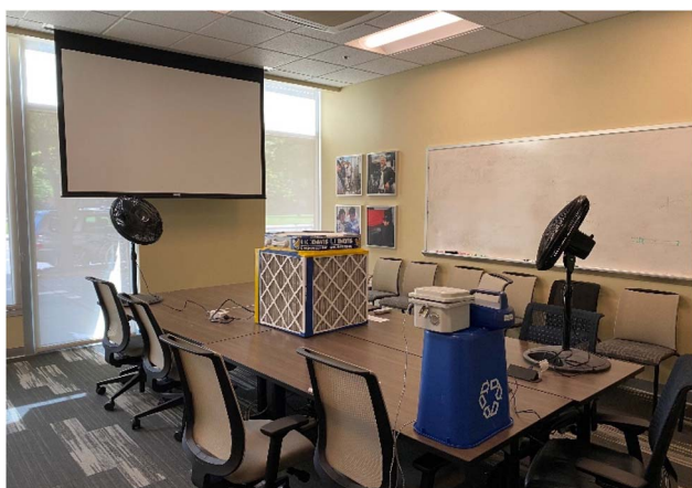
Fig. 1 CR box experimental test setup in a conference room.

The following procedure was used to collect the data required to calculate the CADR: