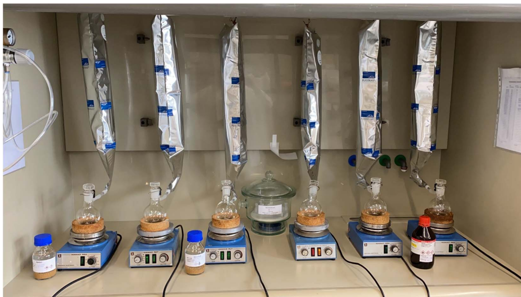
Fig. 1 Silylation work station under argon protection using filled gas bags.