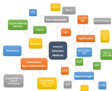
Fig. 3 Different methods of arsenic detection and determination.

The purpose of this review is to provide an overview of the analytical techniques (chromatographic, spectroscopic, colorimetric, biological, electroanalytical and coupled techniques) for arsenic determination in drinking water and the authors have mostly covered the literature over the past decade (2010 onwards). Some older publications are referenced to support the key concepts and wherever necessary. A brief introduction to various analytical techniques followed by an evaluation of their capabilities and performance for arsenic determination are discussed. Associated challenges as well as potential avenues for future research, including the demand for rapid analysis and on-site technologies for remote water analysis and environmental applications are discussed. We hope that this review