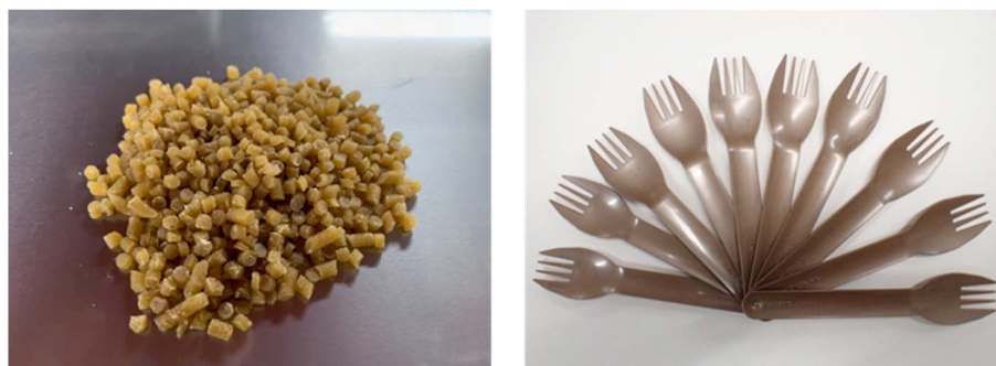
Fig. 42 100% biomass biodegradable resin pellet (Left) and forks (Right) made from Sargassum waste.

to be considered for overall environmental sustainability of a product, it is necessary to acquire a better understanding about the energy demand of bioplastics in the manufacturing process. Schulze et al. investigated on the energy demand of bioplastic materials in injection molding, milling and fused deposition modelling 3D printing procedure in the aspect of manufacturing process. Based on this concept, a quantitative energy related assessment of manufacturing bioplastics in comparison to conventional petroleum-derived plastics could be also possible. It was elucidated that in the case of the energy demand per product, milling has the highest specific energy demand and injection molding demonstrated a lower specific energy demand, but is compromised by the energy required for initial warm up and preparation of the machine. Considering these facts, 3D printing has the lowest energy demand. It was also shown that processing bioplastic and petrochemical