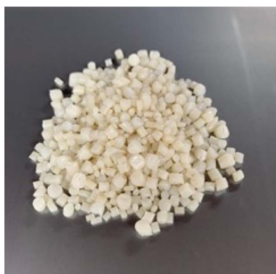
Fig. 7 Starch-based biodegradable plastic prepared with twin-axis extruder composed of 100% biomass. 54

environmentally friendly and ideal in the aspect of not competing with human nutrition. Ngai et al. highlighted the importance of chemical modification to improve the hydrophilicity of cellulose for it to possess water resistance and mechanical strength. They also demonstrated the preparation of cellulose ester-based bioplastic for food packaging application via solvent casting, bar coating, spray coating and immersion coating (Fig. 8). 55 Wang et al. prepared a cellulose-based bioplastic by hot pressing a cellulose hydrogel. The cellulose hydrogel was prepared from cellulose solution in an alkali hydroxide/urea aqueous system by physical cross-linking. The hot-pressing process induced a transition in the aggregated structure in the cellulose resin, resulting in plastic deformation. It was elucidated that the radial orientation of the cellulose molecules occurred in the planar direction of the plate, whereas an increase in amorphous zones appeared in the vertical