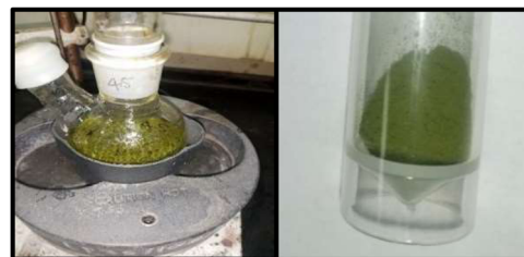
Fig. 1 Synthesis of PANI/Te nanocomposite.

The polymerization process involves a series of reactions between the reagents present. Two significant color changes were observed during the process. The first change occurred when sodium tellurite, present in its white form, was reduced by 2-mercaptoethanol, resulting in the formation of black tellurium. The second change involved the polymerization of aniline into the ES form, causing the solution to turn green, as shown in Fig. 1. Overall, based on previous studies on polyaniline and its composites, 27,29 the polymerization mechanism can be explained in terms of the in situ formation of tellurium nanoparticles, which then act as templates and assist in the polymerization of aniline. It is also likely that initially, aniline monomers form attachments with sodium tellurite molecules, creating a complex which eventually liberates Te nanoparticles.