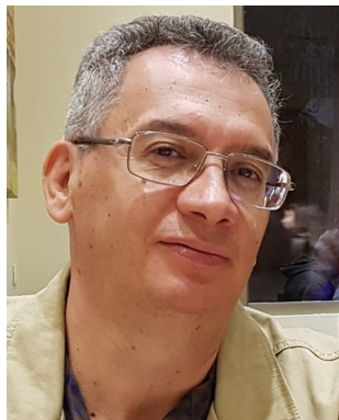
S. W. da Silva

spectroscopy. 8,10,11 The hyperfine parameters obtained from Mössbauer spectroscopy are commonly used to assess the oxidation state of iron in iron oxides. It is commonly known that the isomershift (IS) of \text{Fe}^{3+} in pure oxides is around 0.25 \text{ mm s}^{-1} and 0.29 \text{ mm s}^{-1} for the upper limit in tetrahedral coordination and lower limit for octahedral coordination, respectively. These values are lower than those expected for