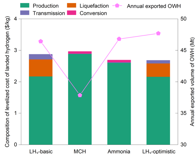
Fig. 11 Comparison of average LCOH L and annual exported volume of OWH via liquid hydrogen, methylcyclohexane (MCH), and ammonia shipping in 2050.

Hydrogen is expected to be an essential part of the global energy trading. Here, we explore the feasibility of the hydrogen economy driven by offshore wind for RCEP members. The results reveal significant differences and complementarities in offshore wind resources and hydrogen demand potential