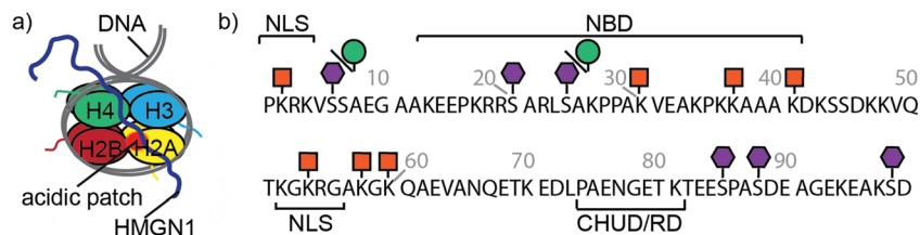
Fig. 1 HMGN1 interacts with nucleosomes and bears phosphorylation, ADP ribosylation and acetylation PTMs. (a) Schematic structure of a nucleosome comprising dimers of each of the four histones H2A, H2B, H3 and H4 wrapped by DNA. HMGN1 (dark blue line) is an intrinsically disordered protein that binds to nucleosomes. Orientation and interaction of HMGN1 is based on that reported for HMGN2. 26 (b) Protein sequence, domains and PTMs of HMGN1. 27,28 Amino acids are represented by their one-letter codes and residue numbers are shown in grey. NLS = nuclear localization signal, NBD = nucleosome-binding domain, CHUD/RD = chromatin unfolding domain/regulatory domain. Lysine acetylation is represented by an orange square, serine phosphorylation by a purple hexagon and ADP ribosylation by a green circle.

Although the precise mechanisms by which HMGN proteins modulate epigenetic processes are still not clear, several studies indicate that these nucleosomal proteins regulate cell-type-specific gene expression, and therefore have potential implications in developmental processes and disease. 11 For example, HMGN proteins have been reported to function as alarmins, 17–19 to have both pro- 20 and anti-tumour 21 activities and to have roles in DNA repair, 22,23 immune regulation 17 and Down syndrome. 11,24 These studies, amongst others, highlight the need to understand the molecular-level interactions of HMGN1.