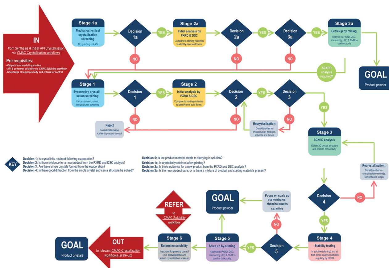
Fig. 1 CMAC multicomponent (MC) material screening workflow. The workflow is driven by the decision points as indicated in the text; these capture the key elements indicating if the co-crystallisation process is likely to have value. Light blue squares indicate points at which the CCDC software tools are implemented. Decision 1: is crystallinity retained following evaporation?; Decision 2: is there evidence for a new product from the PXRD and DSC analysis?; Decision 3: are there single crystals formed from the evaporation?; Decision 4: is there good diffraction from the single crystal and can a structure be solved?; Decision 5: is the product material stable to slurrying in solution?; Decision 1a: is crystallinity retained after grinding?; Decision 2a: is there evidence for a new product from the PXRD and DSC analysis?; Decision 3a: is the new product pure, or is there a mixture of product and starting materials present?

The development of each of the MC material and additive screening workflows are summarised briefly, within the context of the CMAC programme. Both workflows are driven