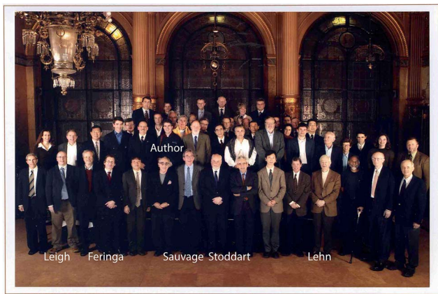
Fig. 4 Participants of the 21 st Solvay Conference on Chemistry "From Noncovalent Assemblies to Molecular Machines", Brussels, Hotel Métropole, 30 November 2007.