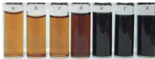
Fig. 11 Photographs of GO suspension with concentration of 0.56 mg mL -1 (a–f) under different conditions. (a) GO aqueous suspension after microwave treatment for 1 min, (b) GO suspension in DMAC/H 2 O (6 : 1), (c–f) GO suspension in DMAC/H 2 O (6 : 1) after microwave treatment for 1, 2, 3, and 10 min (2 min × 5 times), respectively, (g) re-dispersed of the dried graphene into pure DMAC with concentration of 1.0 mg mL -1 . 128

Photo reduction like photo-thermal and photo-chemical reduction of GO is an additive free, facile, clean, and versatile approach to reduce GO. High-quality rGO has been prepared by irradiating GO with sunlight, ultraviolet light, and KrF excimer laser. 129 Ding et al. 130 reduced GO using UV irradiation to obtain single to few-layered graphene sheets without the use of any photocatalyst. Cote et al. 120 prepared rGO by photothermal reduction of GO using xenon flash at ambient conditions and patterned GO or GO/polymer films using photomask. Nano-second laser pulses of KrF excimer laser of 335 and 532 nm effectively reduce dispersed GO to thermally and chemically stable graphene. 131 Photochemical reduction of GO to graphene has also been exploited for patterning. The photo-reduction and patterned film fabrication was carried out with femto-second laser irradiation. 119 The focused laser beam (laser pulse of 790 nm central wavelength, 120 fs pulse width, 80 MHz repetition rate, focused by a ×100 objective lens) was used to heat the