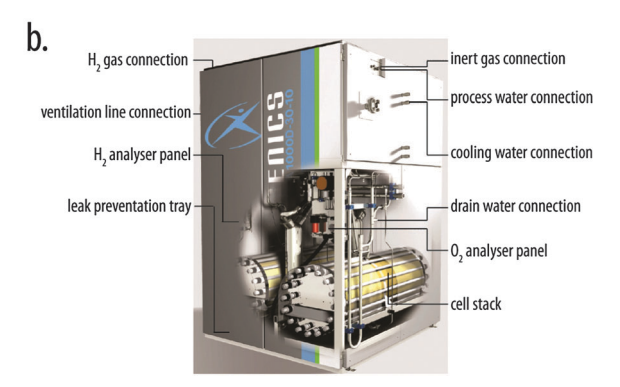
Fig. 1 (a) A schematic illustration of a simple U-tube configuration for water electrolysis. Voltage penalties (overpotentials) increase the total voltage required to operate the system at a given rate relative to the thermodynamically required potential, and include the kinetic overpotentials associated with the hydrogen-evolution and oxygen-evolution reactions (\eta_{\text{HER}} \text{ and } \eta_{\text{OER}}, \text{ respectively}), \text{ the concentration overpotential } (\eta_{\text{con}}), \text{ and } ohmic resistance loss ( \eta_{\text{ohm}} ). The total operating voltage of the system is given by the sum of the thermodynamic voltage for the water-splitting reaction and the total overpotential, \eta_{\text{total}} , for the system. (b) A schematic illustration of a commercially available (Hydrogenics) alkaline water electrolyzer with auxiliary components.7

\eta_{\text{total}} = \eta_{\text{HER}} + \eta_{\text{OER}} + \eta_{\text{ohm}} + \eta_{\text{con}}