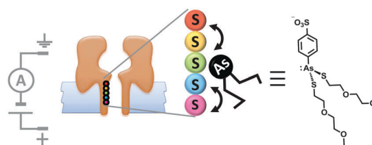
Fig. 18 Stochastic walking of a small molecule within a transmembrane nanopore. 40

in the field of synthetic molecular walkers, the random walk of a small molecule inside a protein nanopore has been observed (Fig. 18). 40 The approach employed a mutant \alpha -haemolysin ( \alpha -HL) nanopore that contained five cysteine residues within the transmembrane stem. The molecular walker was formed in situ by the reaction of 4-sulfophenyl arsenous acid and 2-(2-methoxyethoxy)ethanethiol. Changes in the transmembrane ion current flowing through the pore revealed that the arsenous molecule walked stochastically by reversible formation of covalent bonds between the arsenic of the walker and the cysteine residues in the transmembrane stem. The motion of the walker was biased by the direction of the applied potential to move towards a thermodynamic sink.