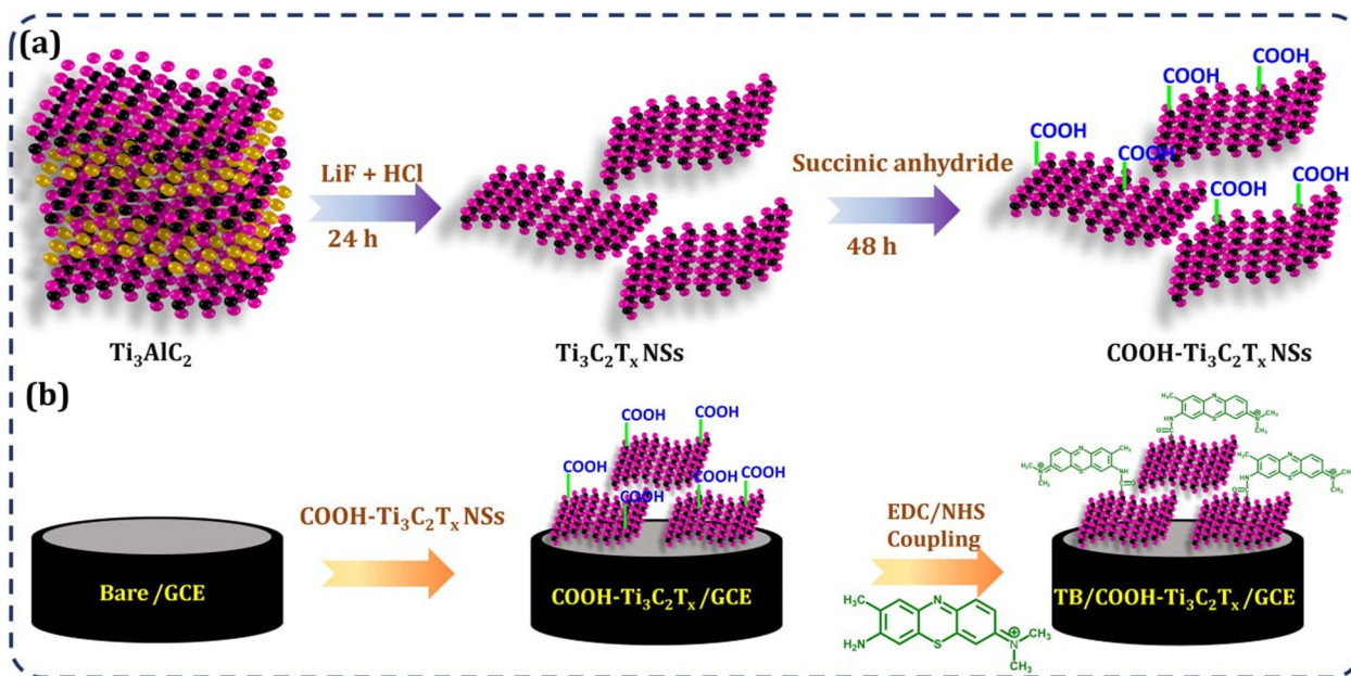
Fig. 1 (a) Schematic representation of the synthesis of \text{Ti}_3\text{C}_2\text{T}_x NSs and \text{COOH-Ti}_3\text{C}_2\text{T}_x NSs. (b) Stepwise fabrication of the \text{TB/COOH-Ti}_3\text{C}_2\text{T}_x/\text{GCE} .

thoroughly with DI water and centrifuged at 3000 rpm until all the remaining residual succinic anhydride was