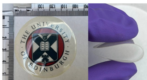
Fig. 4 A robust, optically clear, self-standing film of BTfMA-DPE fabricated from chloroform solution using the techniques of simple solvent-casting (5 cm diameter, 100 \mu m thick).

To conclude, BTfMA is a readily prepared monomer that has been demonstrated to undergo efficient polymerisation mediated by a superacid. When copolymerised with DPE , a rigid polymer with good film-forming properties is rapidly produced. It is anticipated that BTfMA has excellent potential for enhancing the permeability of membrane-forming polymers that are produced using superacid polymerisations by the introduction of greater free volume.