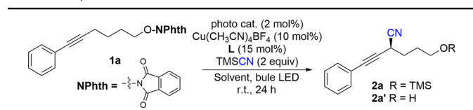
Table 1 Optimization of the reaction conditions a,b

To get more insights into the reaction mechanism, we first measured the reduction potential of 1a to be E_p^{0/-1} = -1.51 V vs.