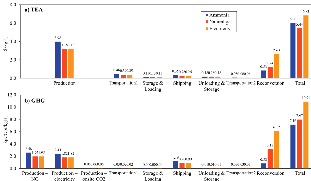
Fig. 7 Effects of reconversion fuel option on (a) LCOH and (b) GHG emission (U.S. to Japan, ATR-CCS-OC, grid electricity use, MDO for shipping fuel, 17.2 tonnes H 2 per h delivery).

different countries. Fig. 8 presents a comprehensive comparative TEA and GHG estimate of domestic ammonia production utilizing ATR-CCS-OC across 63 major countries. According to the TEA results in Fig. 8(a), production costs exhibit substantial variation, ranging from $0.38 per kgNH 3 (Saudi Arabia, SA) to $4.42 per kgNH 3 (Argentina, AR). (Note that, Venezuela, VE, exhibits exceptionally low FCR and fuel costs due to high