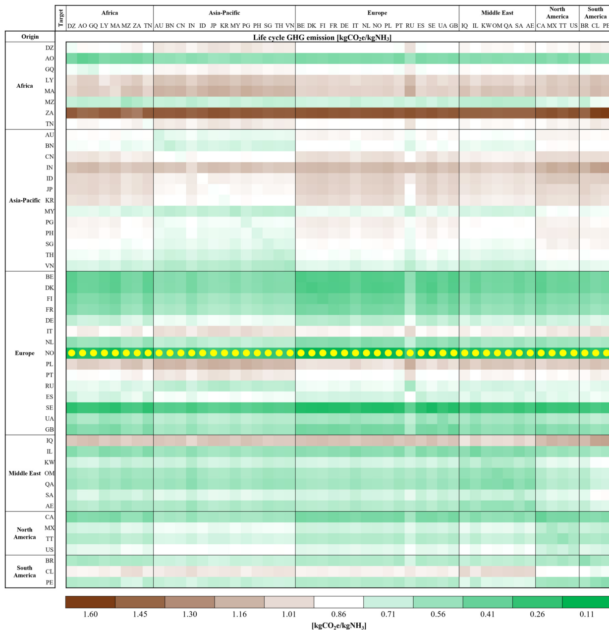
Fig. 13 Blue NH 3 inter-country emission [kgCO 2 e per kgNH 3 ]. Note that, EG, NA, NG, KZ, TM, UZ, AZ, CZ, BO, TR, IR, AR, and VE have been excluded for clearer visualization due to their out-ranged FCR, source availability, and their landlocked location. The diagonal line represents the domestic production cases. Yellow dot indicates the lowest origin country option for the corresponded target country.

hydrogen storage tank) and Fig. 15 shows the life cycle GHG emission results of the corresponding cases. The color gradients provide intuitive visualization of cost and emission metrics: in the LCOA matrix, blue indicates lower costs while red indicates higher costs; in the life cycle GHG matrix, green represents lower emissions while brown represents higher emissions. Yellow dots highlight the lowest-cost origination country option (row) for each corresponding destination country (column), and diagonal elements represent domestic production–consumption scenarios.