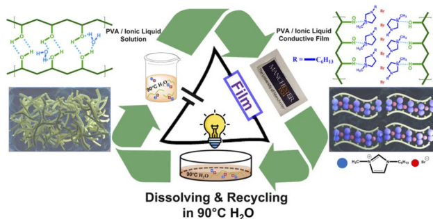
Fig. 1 The schematic diagram of the experimental study of the PVA/Br-IL ion-conductive film.

The synthesis route and design strategy of the PVA/Br-IL film are shown in Fig. 1. First of all, polyvinyl alcohol was selected as the basic polymer network for the design of a multi-functional