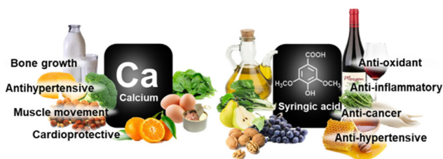
Fig. 1 Occurrence and bioactivity of CaSyr-1 building blocks.