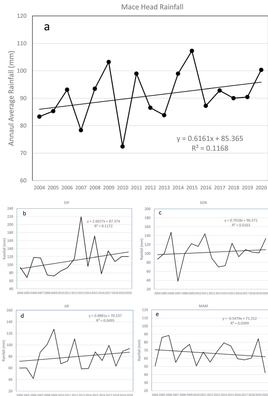
Fig. 4 (a) Annual average rainfall at Mace Head, Ireland (2004–2020). (b–e) Seasonal average rainfall for DJF, SON, JJA and MAM, respectively.

The long-term average \text{CH}_4 emission flux found here of 0.37 \pm 0.2\text{ }\mu\text{g m}^{-2}\text{ s}^{-1} ( 0.33 \pm 0.07\text{ }\mu\text{g m}^{-2}\text{ s}^{-1} in our previous study) compares favourably with the emission of 0.3\text{ }\mu\text{g m}^{-2}\text{ s}^{-1} ( 7.1\text{ g C per m}^2\text{ per year} ) reported for northern peatland bog sites. 5 A