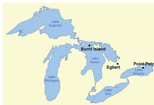
Fig. 1 Great Lakes Basin sampling stations.

Air sample collection procedures have been summarized by Wu et al. 20 In brief, air samples were collected (24 h integrated, approximately 350 m 3 volume) with a PS-1 high volume air sampler equipped with a glass fiber filter (GFF) and a polyurethane foam (PUF) plug to allow for separate determination of particle-phase and vapour-phase airborne contaminants. From