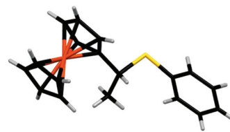
Fig. 1 X-Ray crystal structure of 4 . Colour scheme: Fe orange, S yellow, C black, H grey.

We next investigated the reaction of 1^+ with hexanethiol and thiophenol. In both cases, the reactions progressed effectively, producing good yields of thiol-addition compounds 3 and 4 19 following conversion of the \text{Fc}^+ state to the corresponding Fc derivative by treatment with ascorbic acid (ESI † ). Interestingly, in all cases examined, NMR spectroscopy indicated that the sulfide unit is attached to the \alpha -carbon, rather than the \beta -carbon of the alkene, which would be expected if the reactions proceeded via a CA-type reaction. The presence of the doublet for the hydrogen atoms of the methyl group is particularly diagnostic of \alpha -addition. We have obtained the X-ray crystal structure of the thiol addition product 4 which corroborates our NMR data by clearly showing that it is the \alpha -carbon that is functionalised (Fig. 1). 20 Furthermore, the