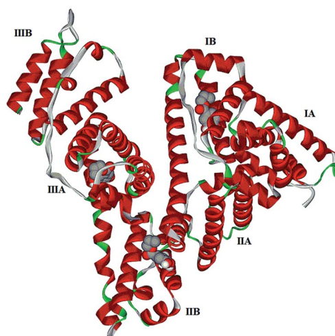
Fig. 5 Docking interaction of PG and HSA. PG molecules are shown as CPK and protein is represented as solid ribbon.