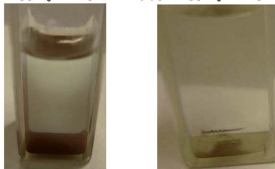
Fig. 1 Visual observation of the disproportionation of CuBr in DMSO with 0.5 equivalent (a) and 1 equivalent (b) of Me 6 -TREN after 3 h at 25 °C. Conditions: DMSO = 1.8 mL; (a) [CuBr]/[Me 6 -TREN] = 1/0.5 and (b) [CuBr]/[Me 6 -TREN] = 1/1.