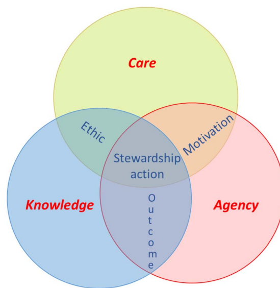
Fig. 2 Meanings and domains of stewardship guiding chemistry's role in material stewardship Reproduced from ref. 54 under CC BY-NC-ND license.

2.3.1 Care: taking responsibility for stewarding the Earth's physical and biological resources. Several frameworks linked to