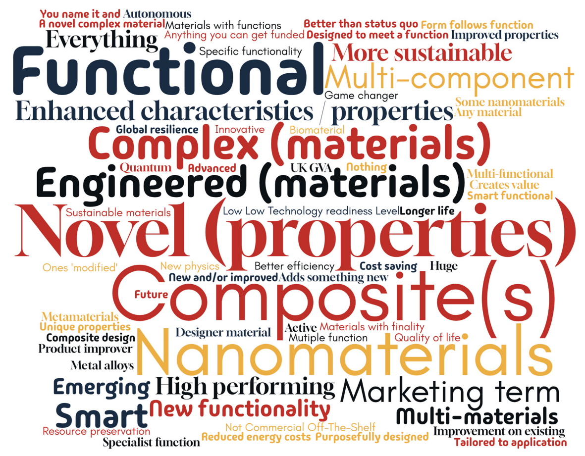
Fig. 1 Word cloud response to the question - What do you define as an Advanced Material? (111 responses). Note that limited preprocessing of responses was undertaken prior to generating word clouds to group similar terms and harmonise

trust and acceptance by society, but the two most popular were understanding legislation and finance (Fig. S3†).