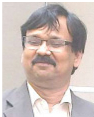
Dilip Kumar Maiti

Despite the numerous review papers published on MOF materials, there is a scarcity of reviews focusing on the recent advancements in Zr-MOFs and their biomedical applications. 19–24 In this review, we have summarized different groups of Zr-based MOFs (Scheme 2) and their unique characteristics that are of benefit for biomedical applications. A comparative analysis of