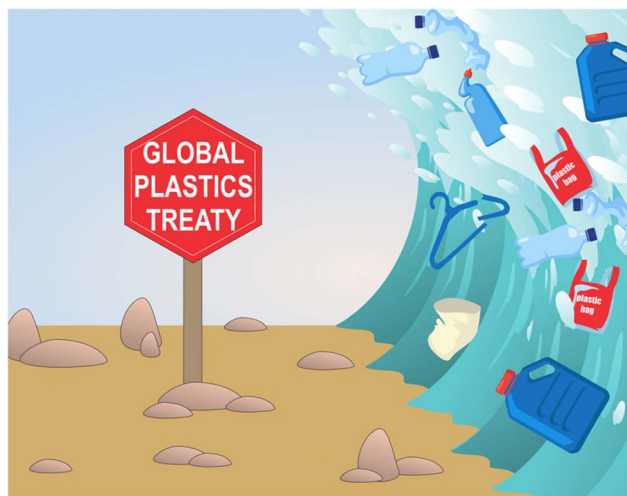
Fig. 3 Global Plastics Treaty's potential to halt the plastic surge is being questioned. 10

probable effect on human health and the economy demands stringent regulations, standard sampling techniques, robust analytical tools, and reporting units. 11 The quantity methods embraced for PM are largely gravimetric or real-time. PM is gathered on a surface or filter to be analyzed later using a gravimetric measurement. Gravimetric techniques can be carried out in either a passive or active manner, such as by utilizing a gravimetric collector 12 or a vacuum pump. Fig. 4 displays the atmospheric processes on MPs that can be divided into three parts, (I) emission of pristine MPs which makes them airborne, (II) MP photodegradation, and (III) MP degradation.