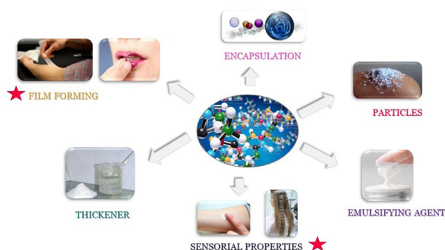
Fig. 5 Summary of some of the most extended roles of polymers in cosmetic products.

Polymers are a very important class of raw materials in the fabrication of cosmetics formulations, presenting a broad range of functions. The broad range of functions is due to the structural diversity of polymers, which enable the use of polymers as rheology modifiers, thickeners, foam stabilizers and destabilizers, emulsifiers, fixatives, conditioning, and film formers. 79–81 Moreover, polymers can be also used for preparing nanoparticles for delivering of active ingredients. 67 Fig. 5 summarizes some of the most common functions of polymers in the cosmetic industry.