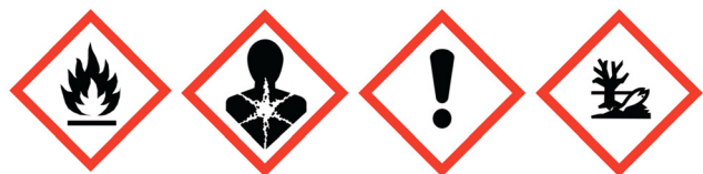
Fig. 5 Hazard pictograms for limonene in European Union countries (from left to right): GH502 (flammable); GH508 (serious health hazard); GH507 (health hazard); GH509 (hazardous to the environment).

Said otherwise, even though we are dealing with a health-beneficial substance 56 possessing immunomodulatory activity (it modulates T lymphocyte activity and viability), 62 its handling and use on a massive scale requires following appropriate regulatory guidelines to prevent accidents and occupational disease, as well as to mitigate risk in the case of accidents. Companies planning to use limonene as a natural product extraction solvent will therefore use extractors and solvent storage units intrinsically capable of preventing the accidental release of the terpene. The extraction and storage units containing the solvent will be kept in tightly closed containers placed in a dry, cool and well-ventilated place, away from heat, sparks and flame, strong acids and bases, oxygen, and other oxidizing agents. Workers working at the maintenance of the extraction and storage units will use protective gloves, eye-glasses, and clothing to reduce the risk of dermal and eye irritation in the case of accidental contact.