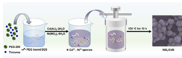
Fig. 1 A schematic illustration of the formation of \text{NiS}_2/\text{CdS} photocatalyst.

For the characterization of the obtained samples, the following techniques were used. X-ray powder diffraction (XRD) performed on a D/max-2550/PC diffractometer (Rigaku), a scanning electron microscope (SEM), energy dispersive X-ray spectroscopy (EDS), and elemental mapping images on a Hitachi