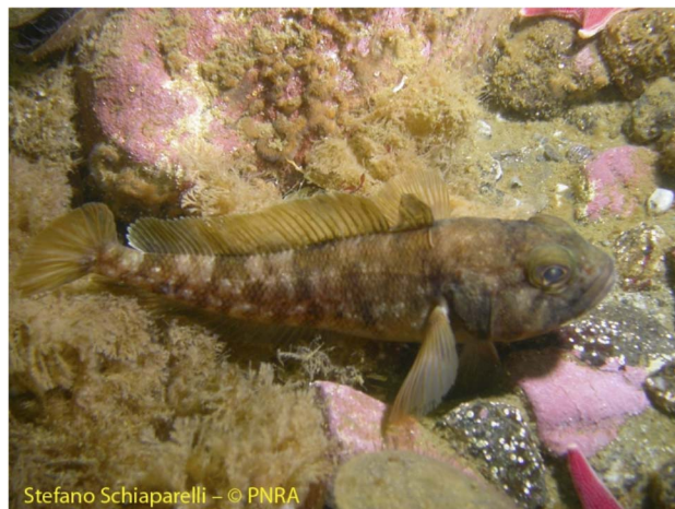
Fig. 3 A specimen of Trematomus bernacchi.

In order to compare with and complement observations in the Arctic, the following discussion focuses on POP temporal trends in marine fish and Adélie penguins. These species are native to Antarctic marine environment and thus suitable to study temporal changes in contaminant exposure in this region. The Tables 1–4 report the concentrations of POPs in the most studied fish and penguin species. Among POPs, we selected PCBs, p,p' -DDT, p,p' -DDE, DDTs, and HCB since other chemicals, including emergent contaminants, were reported only in few articles.