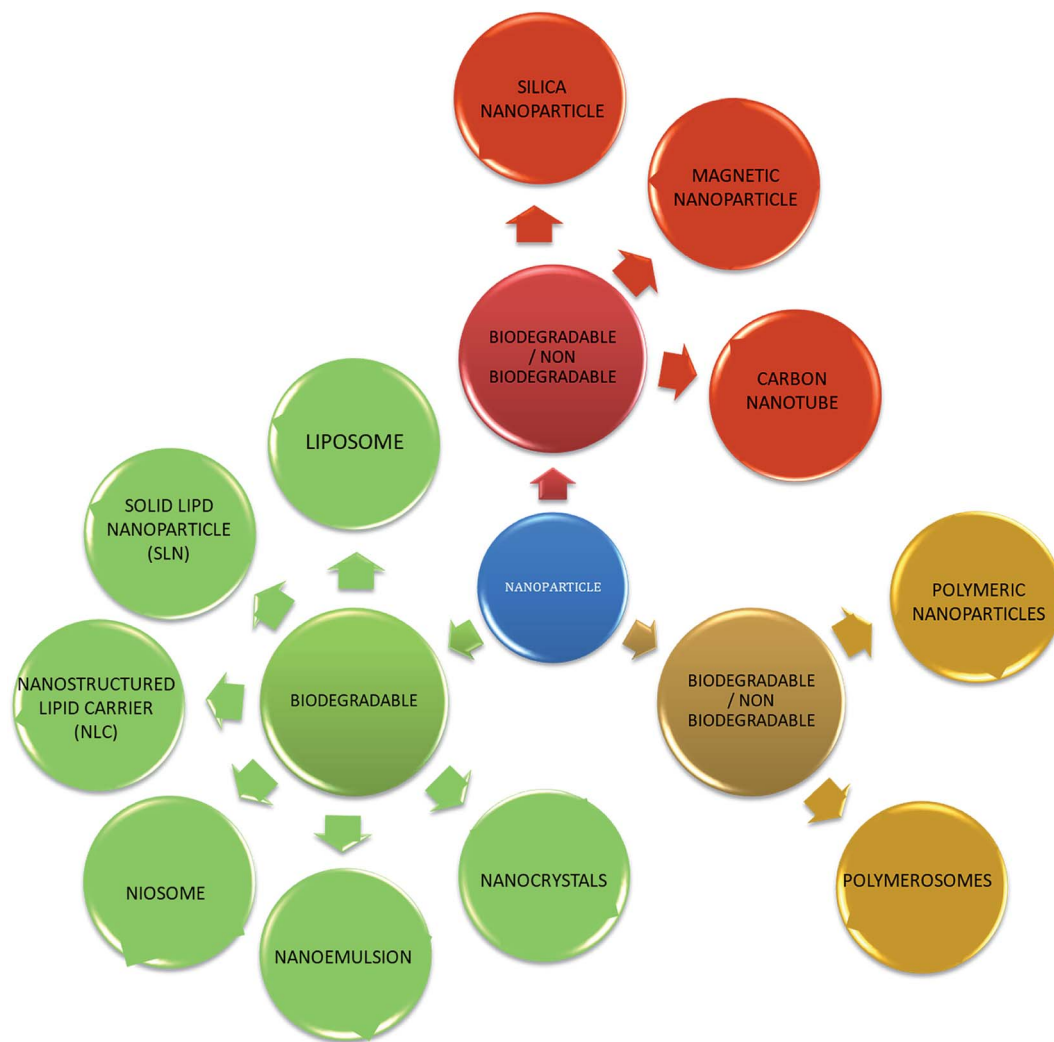
Fig. 1 Schematic diagram of the different types of nanoparticles.

distribution. Furthermore, metabolism and elimination depend on the aforementioned properties. 1 The formulation design has a major impact on the effective delivery of the active pharmaceutical ingredient (API), and thus all the above parameters are crucial challenges. Drugs based on the HLB scale are categorized into two classes, hydrophilic and lipophilic molecules. Lipophilic molecules exhibit very poor solubility, and depending on this, they produce a great challenge to design safe, efficacious, and cost-effective drug delivery systems and have been a source of frustration for pharmaceutical scientists. 2 Lipophilic molecules allow the design of formulations for hydrophobic drug molecules, and despite all the problems confronted by pharmaceutical scientists, the current solid lipid nanoparticles are the result of their great effort. Traditionally, lipid-based novel drug delivery systems have focused on the delivery of lipophilic molecules, but recently, lipid drug delivery systems have received attention due to their inherent properties such as biocompatibility, self-assembly capabilities, ability to cross the blood brain barrier, particle size variability and finally cost effectiveness, making lipid-based