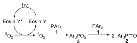
Scheme 2 Proposed mechanism.

oxidation process. The trapping product, 9,10-dimethyl-9,10-dihydro-9,10-epidioxyanthracene, was also observed in crude ^1\text{H} NMR analysis. 17 Styrene and cyclohexene was also added to the reaction system to trap phosphadioxirane, but no trapping species was detected. 18a